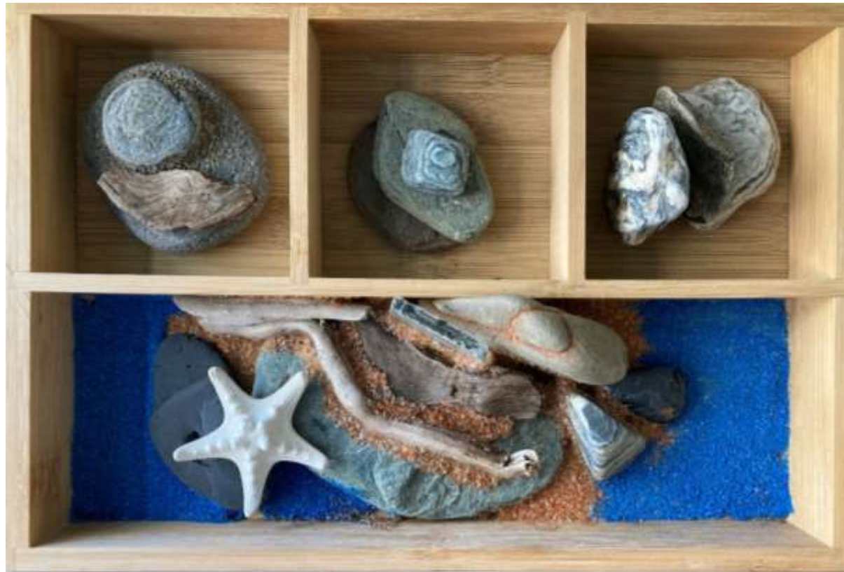
Above: Banfield Resident's Beach Inspired Artwork on Display in Tranquility Lounge